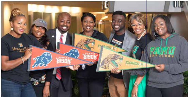
AbbVie alumni from Howard University and Florida A&M University.

See what kind of difference you can make: Visit abbvie.com/careers