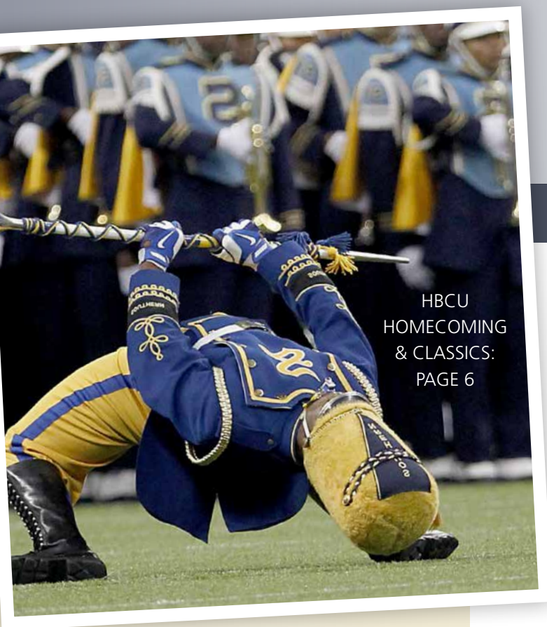
HBCU HOMECOMING & CLASSICS: PAGE 6